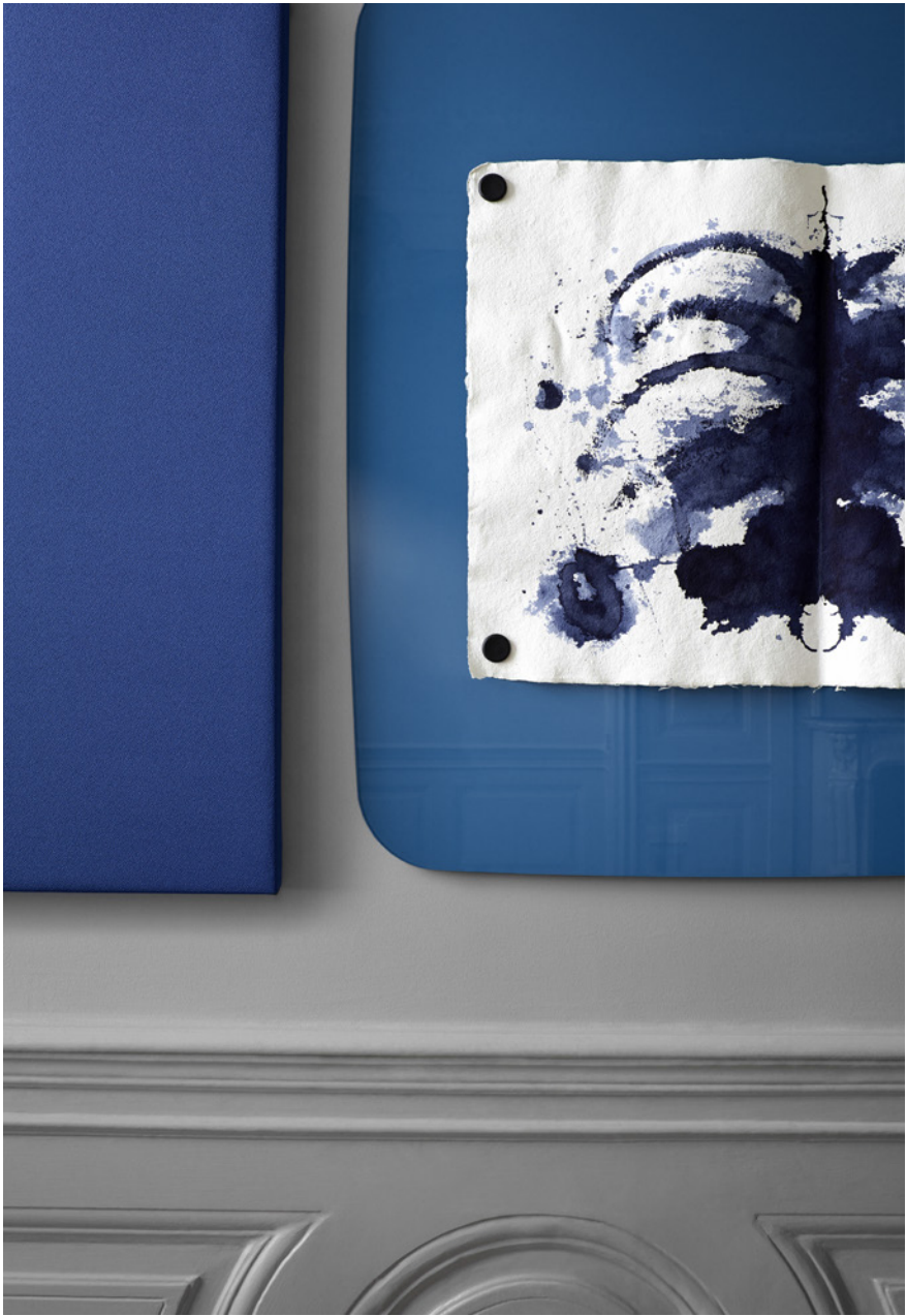
Mood Flow Glass magnetic writing board

Mood Flow can be combined with other Lintex products, such as Edge Wall as shown here, a sound-absorbent wall element with a textile covering. Mood Flow and Edge Wall are both available in a range of sizes and colours.