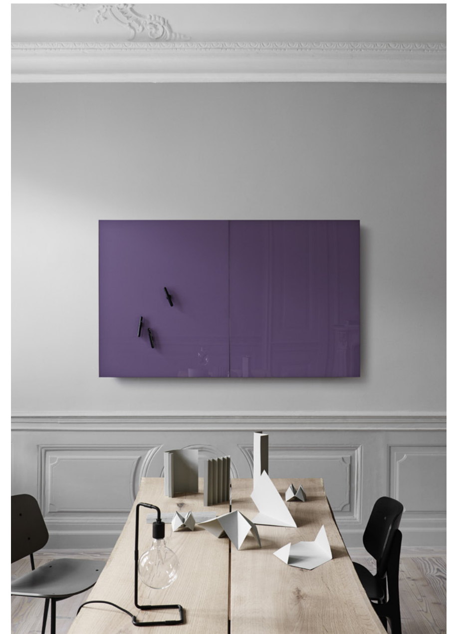
M Box (left) Storing accessories Magnetic soft-close glass front 24 standard colours