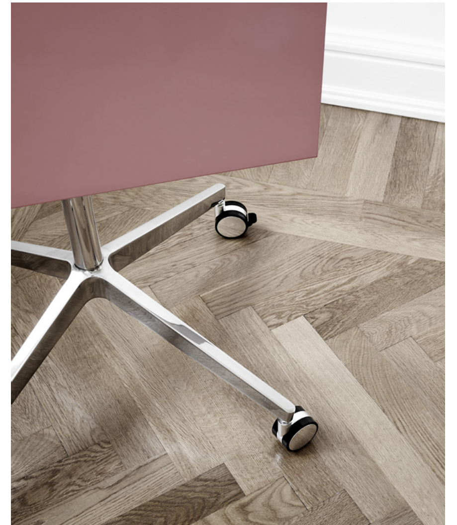
M3 Mobile Glass