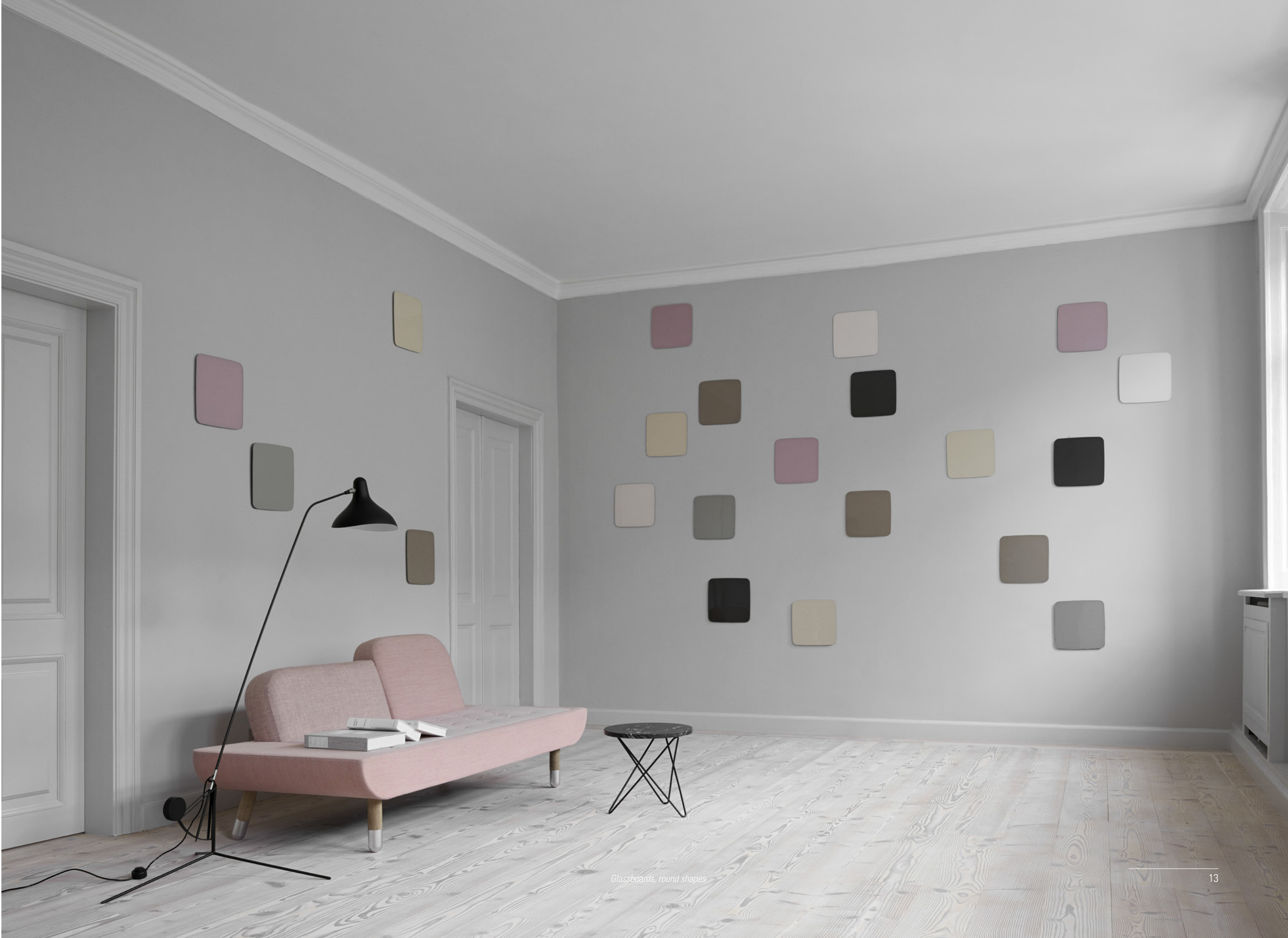
Glassboards, round shapes

Mood Flow The glass magnetic writing board is available in 24 standard colours and 10 sizes