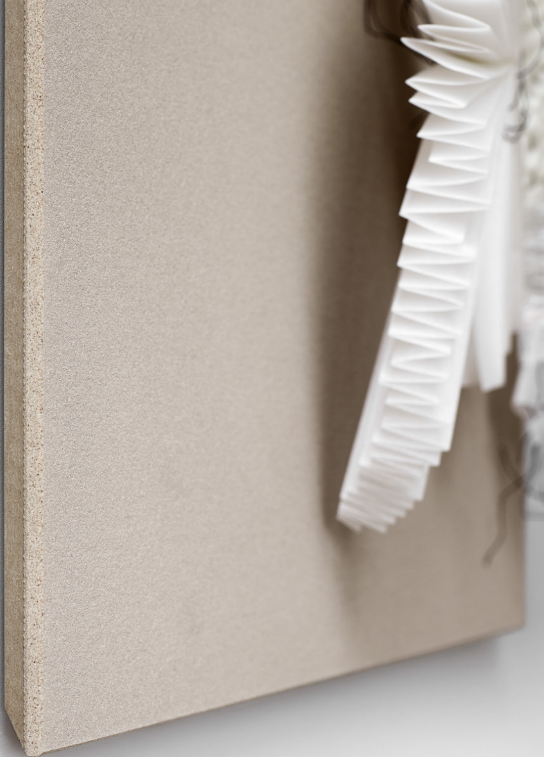
Air Bulletin Board With bevelled edges and concealed mountings