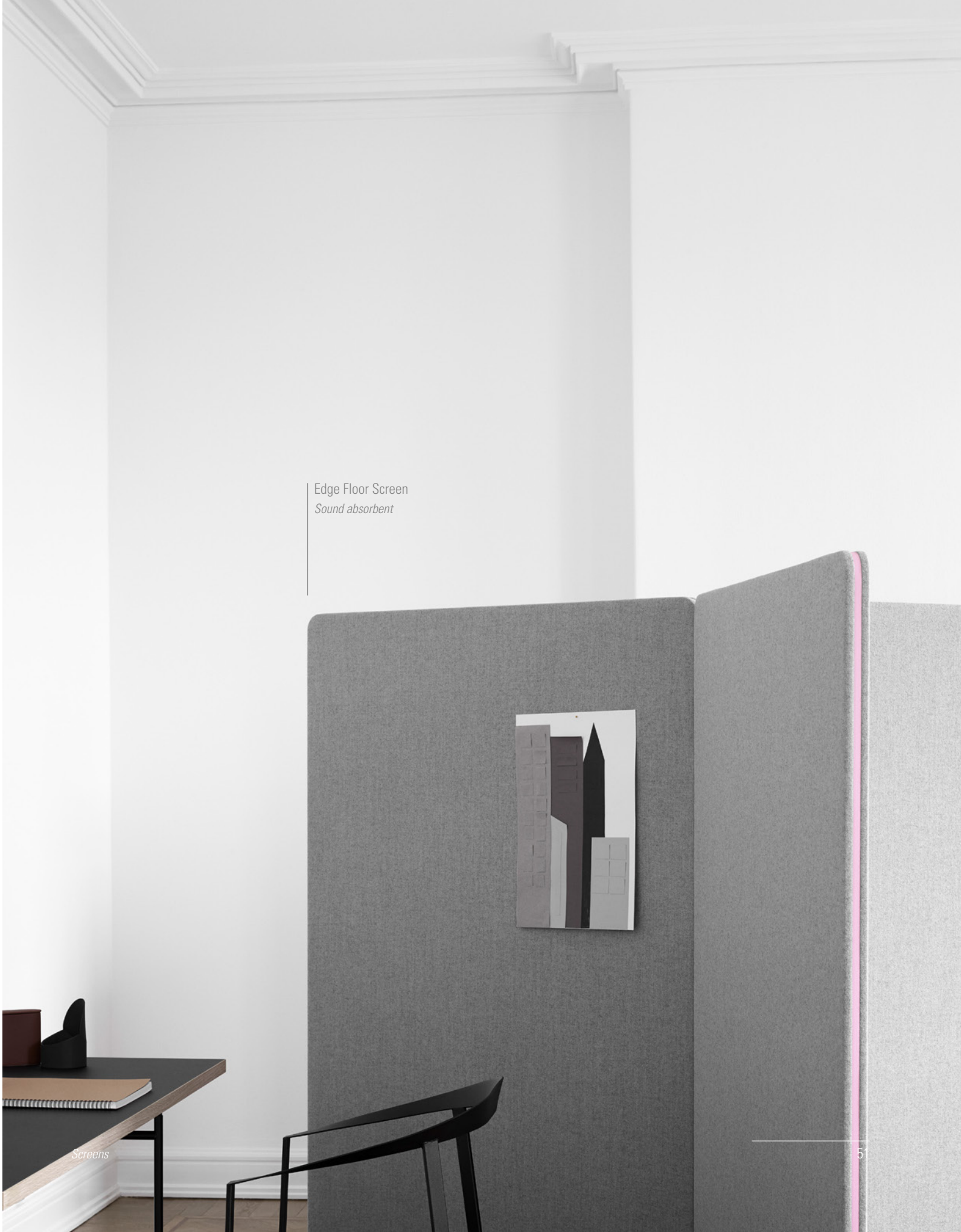
Edge Floor Screen Sound absorbent

Design, Edge: Christian Halleröd Design, Zon: Matti Klenell