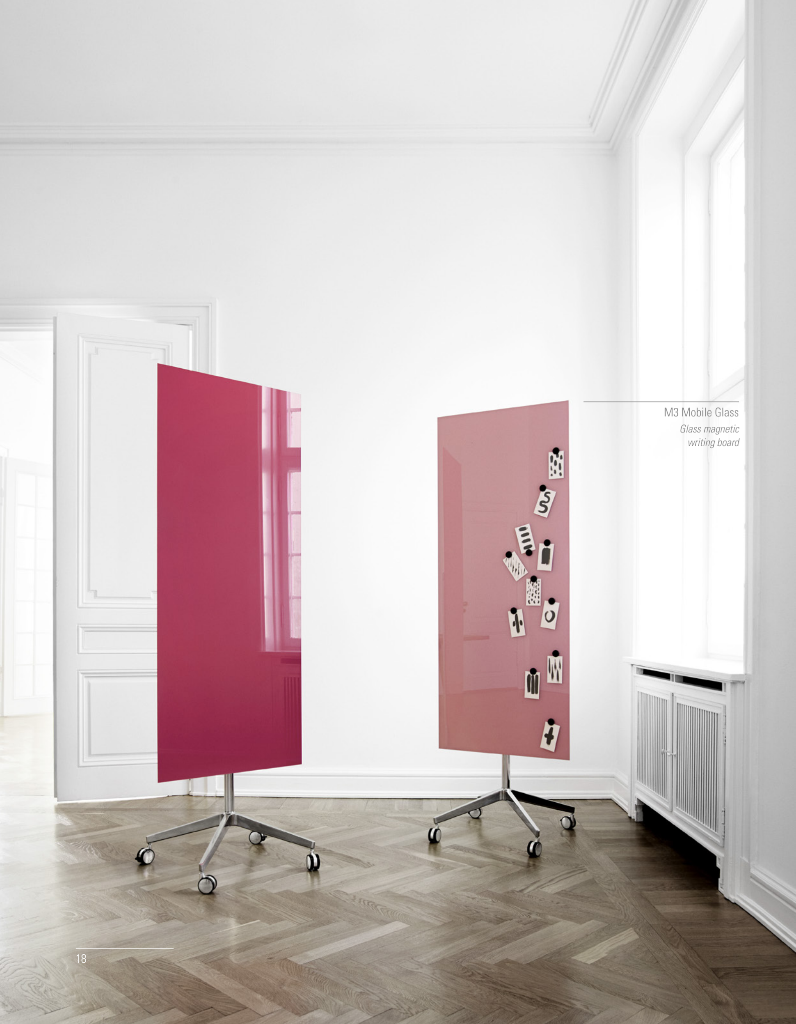
M3 Mobile Glass Glass magnetic writing board