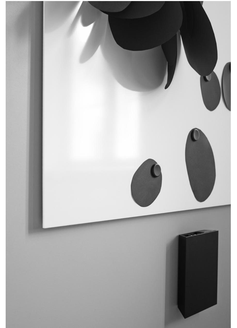
Air Pocket Black or white aluminium and 24 glass colours