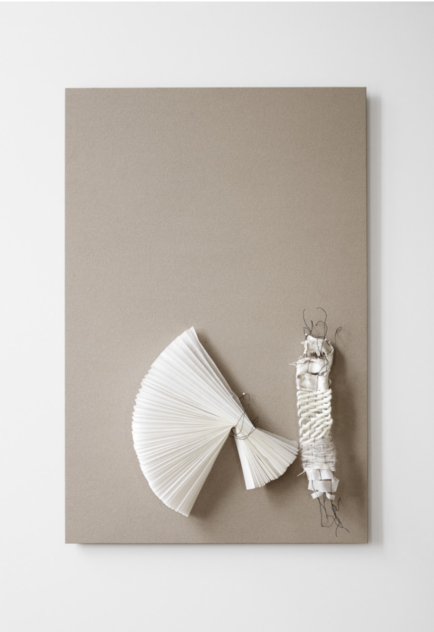
Air Bulletin Board