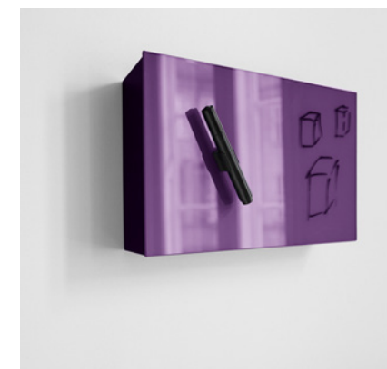
Air Pocket (right) Storing accessories With glass or aluminium front