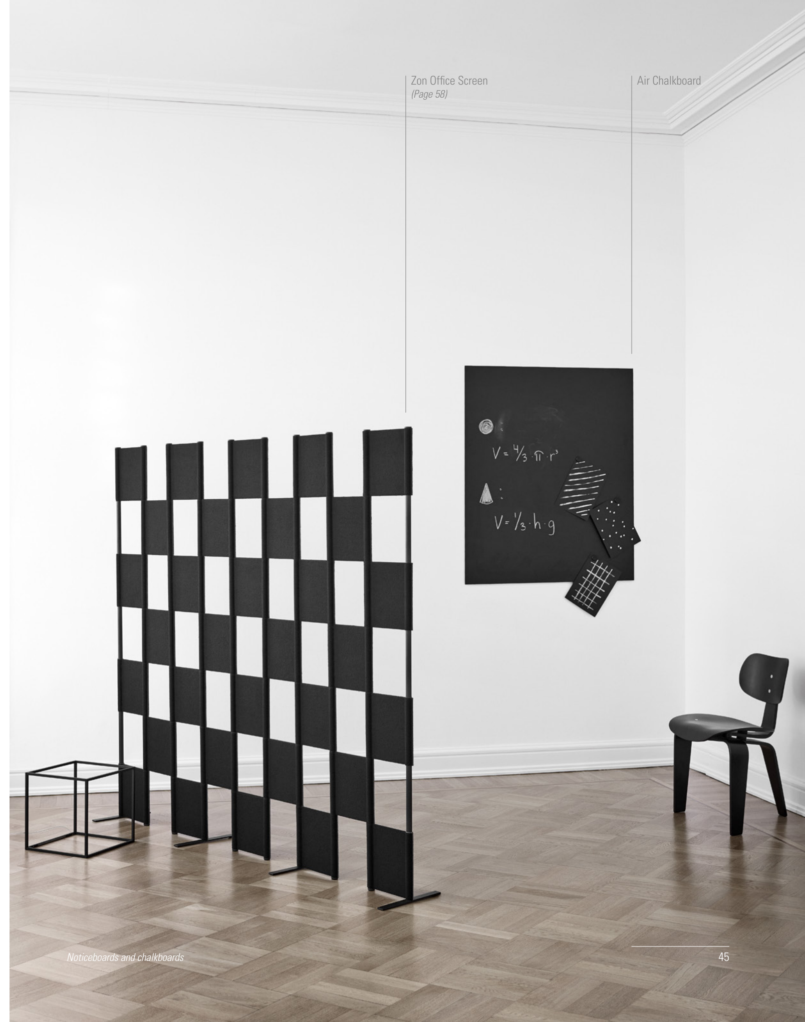
Zon Office Screen (Page 58)