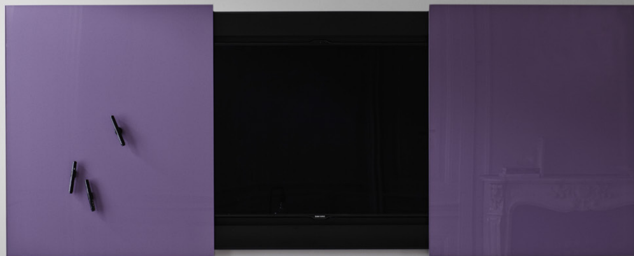
M5 Conference With flatscreen