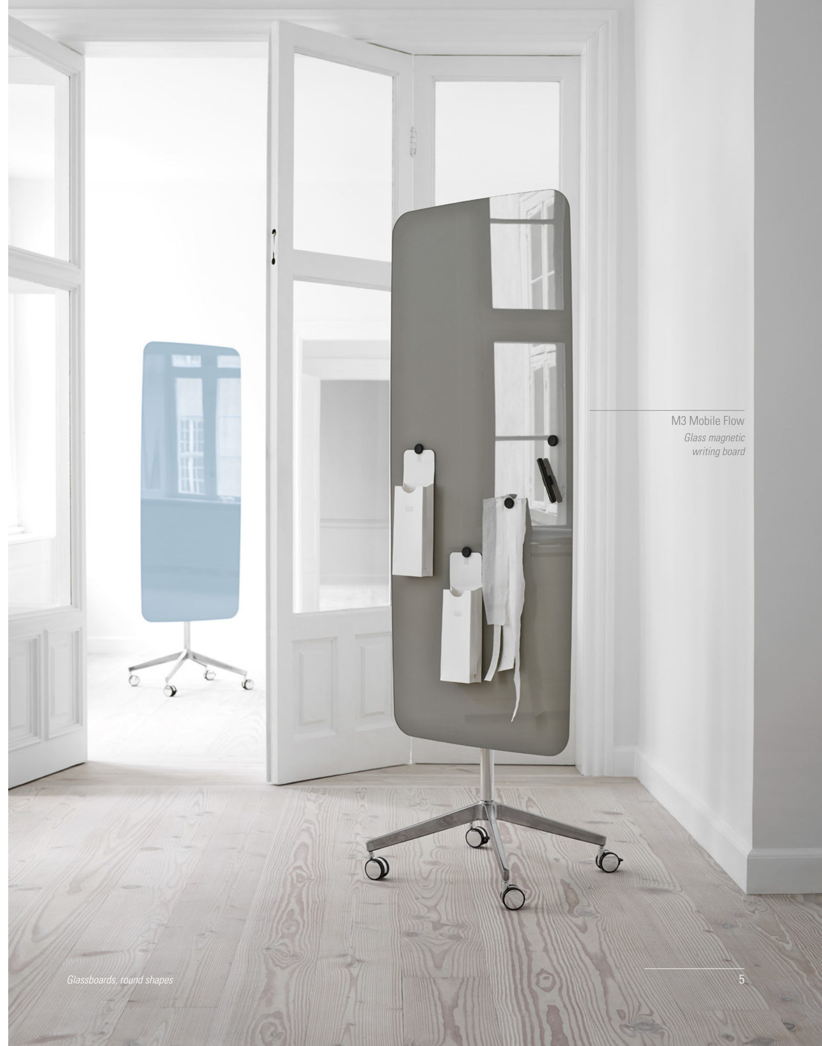
M3 Mobile Flow Glass magnetic writing board