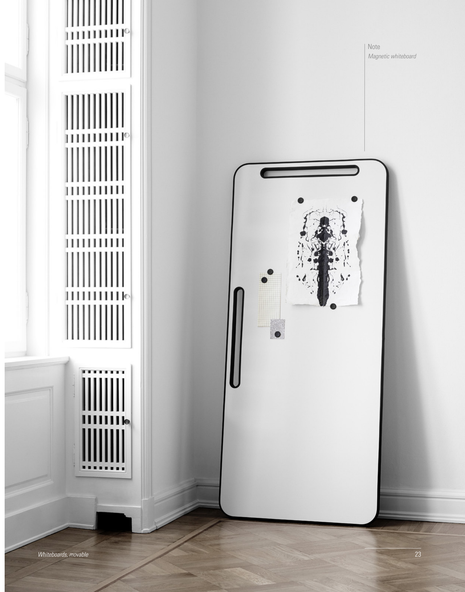
Note Magnetic whiteboard