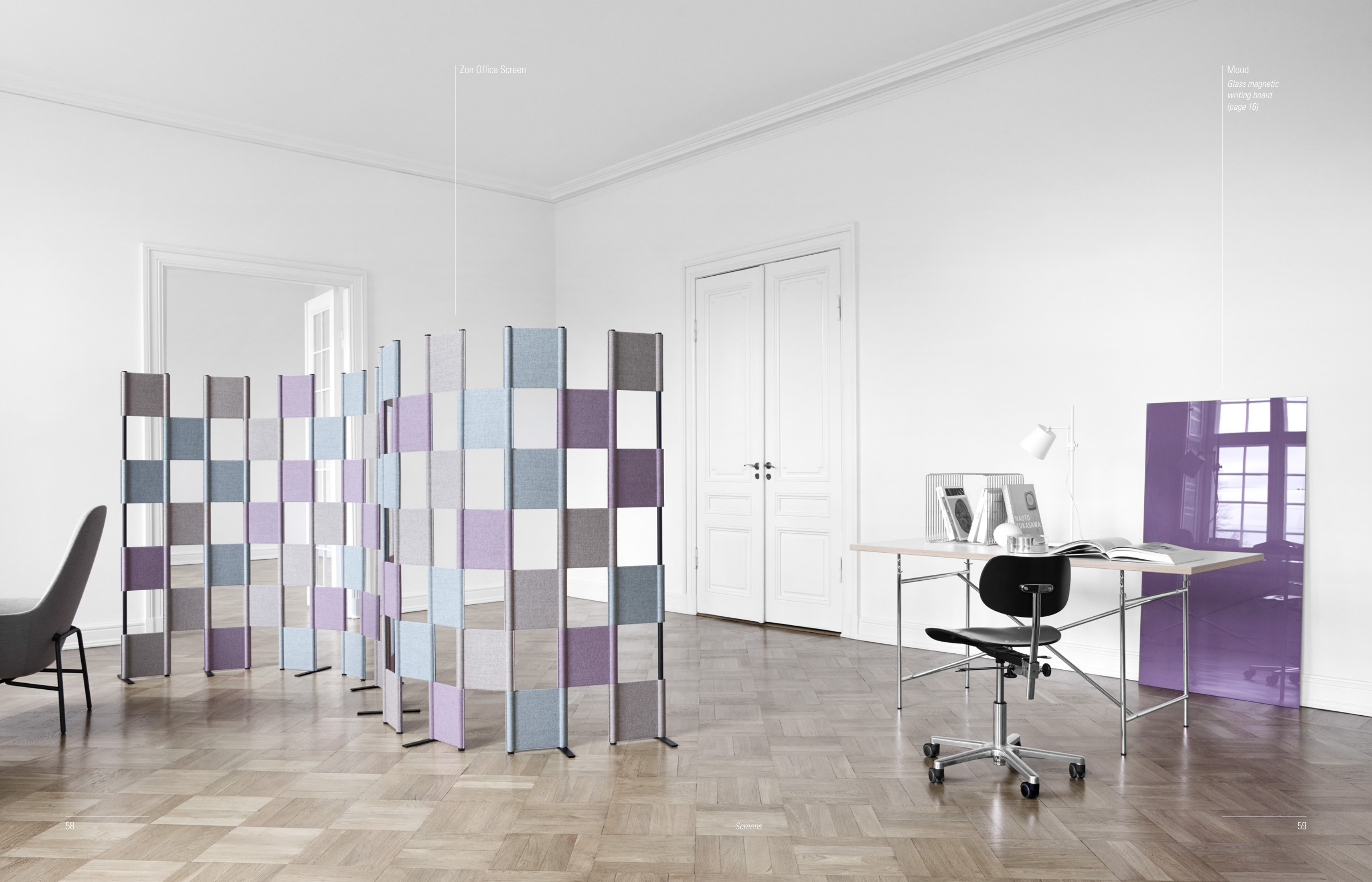
Zon Office Screen