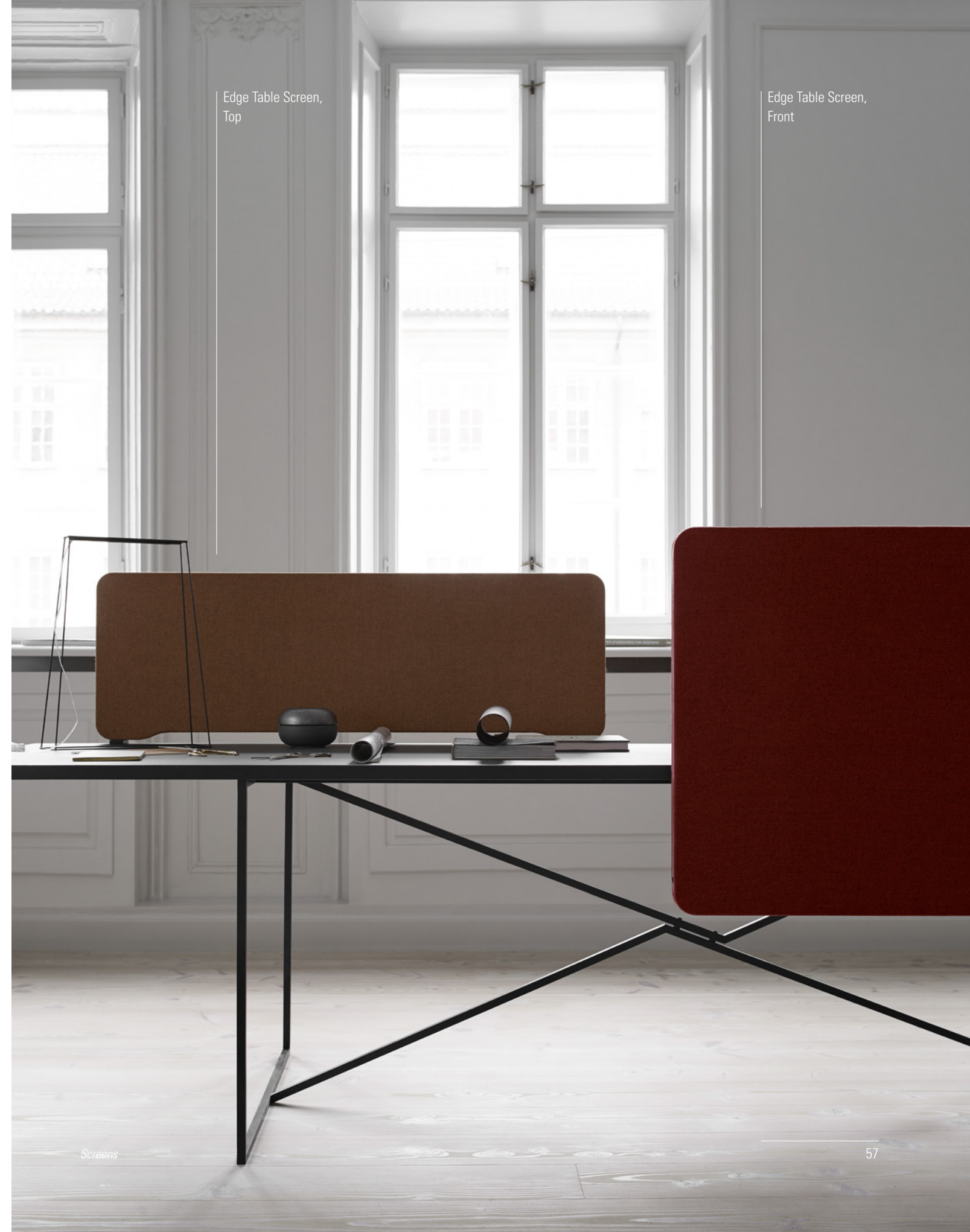
Edge Table Screen, Top

Like Edge Floor Screen, Edge Table Screen is also sound-absorbent. Comes ready for attachment to the table – front or top mounted.