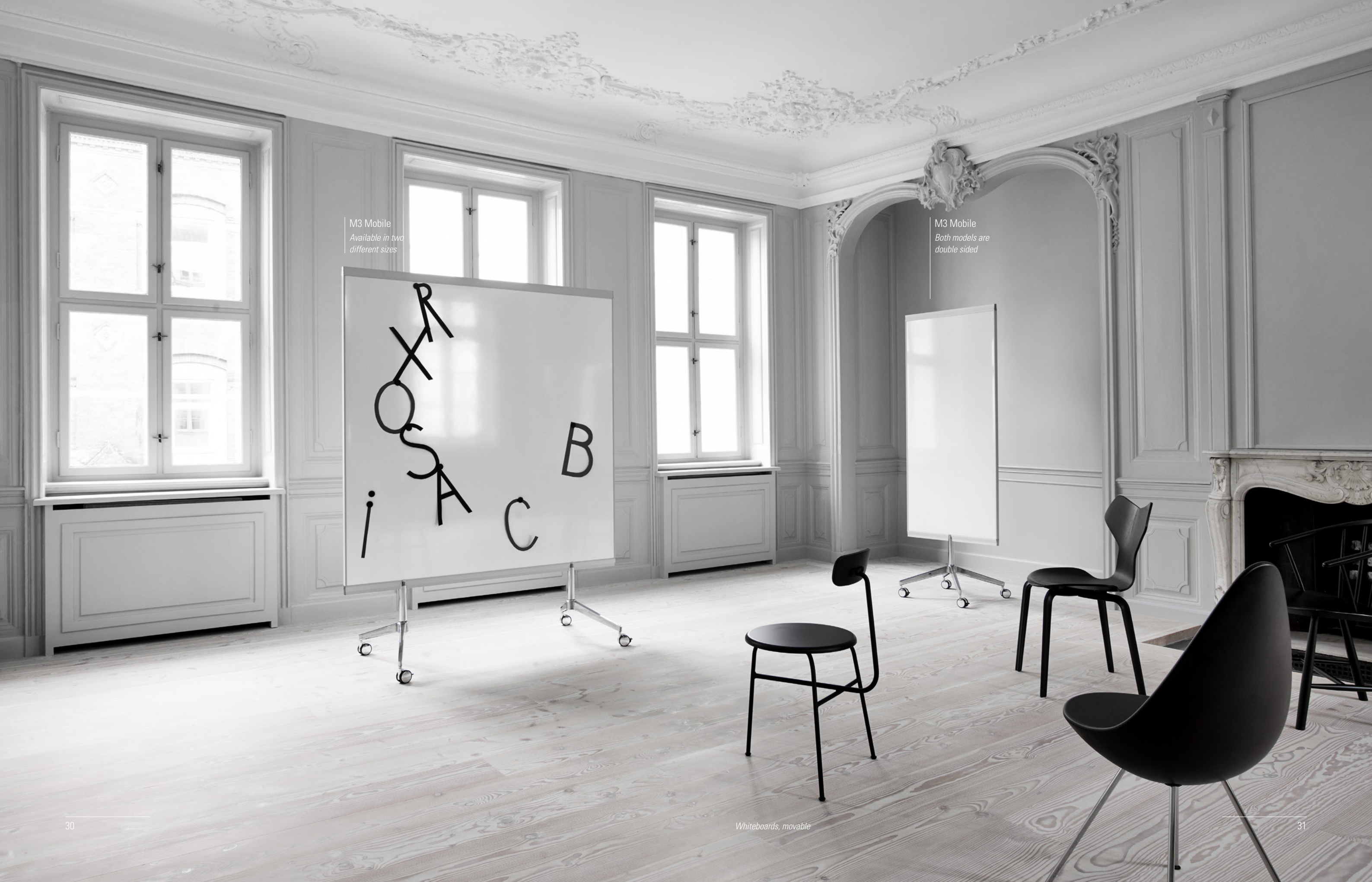
M3 Mobile Available in two different sizes