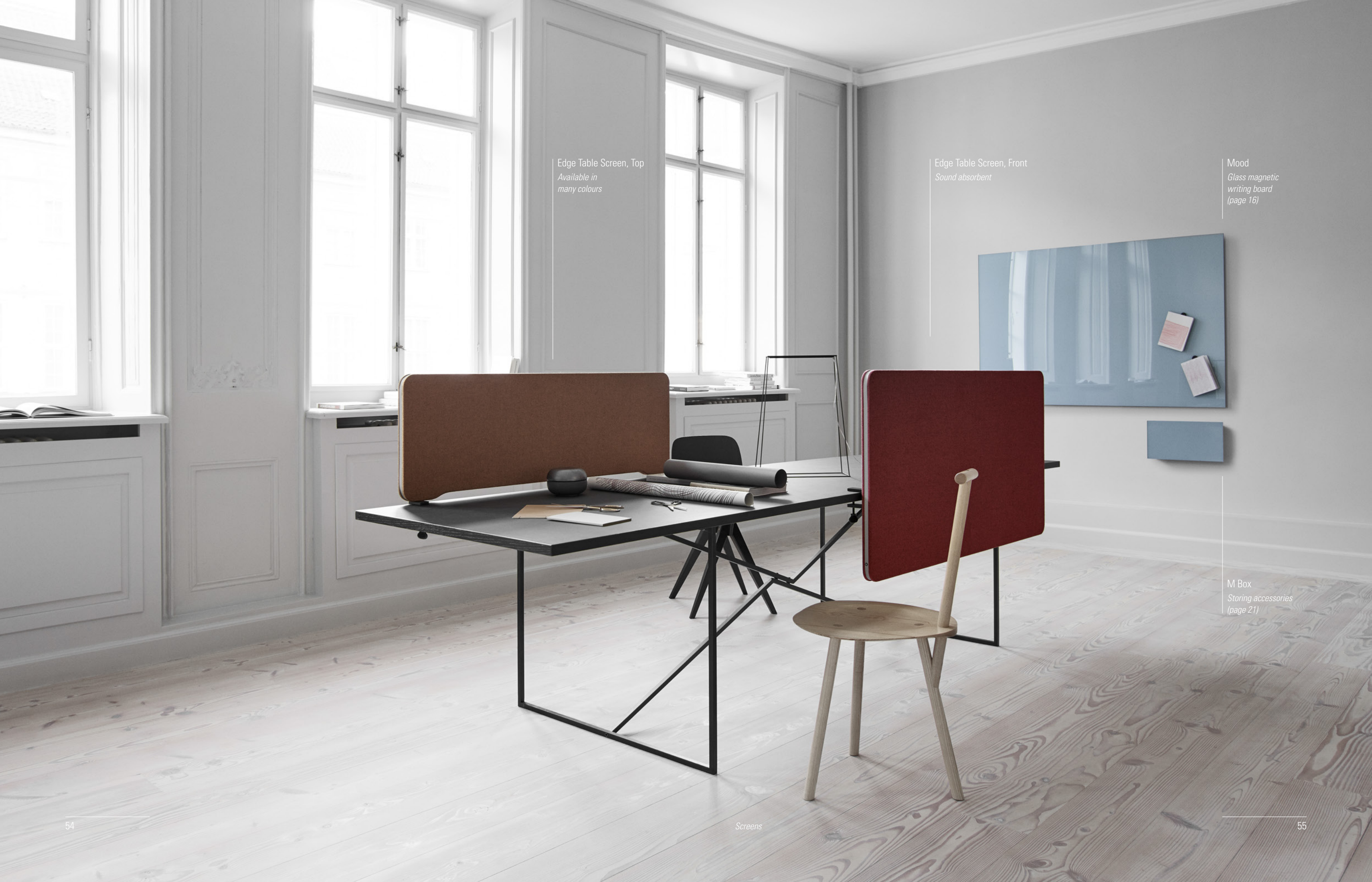
Edge Table Screen, Top Available in many colours