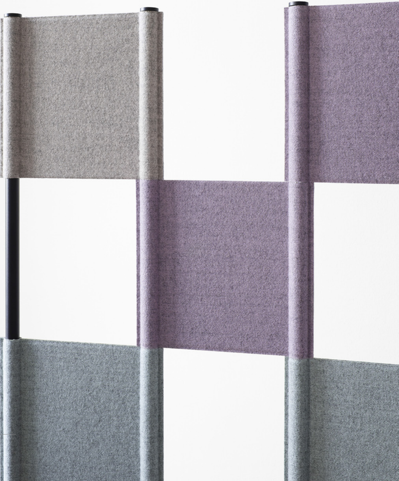
Zon Office Screen

Zon Office Screen, a flexible screen that can be placed standing on the floor in soft formations or straight arrangements. It can also be suspended from the ceiling as a curtain to screen off spaces. The chequered pattern formed by the overlapping felt boards gives it a unique and architectural expression, enabling numerous options for change.