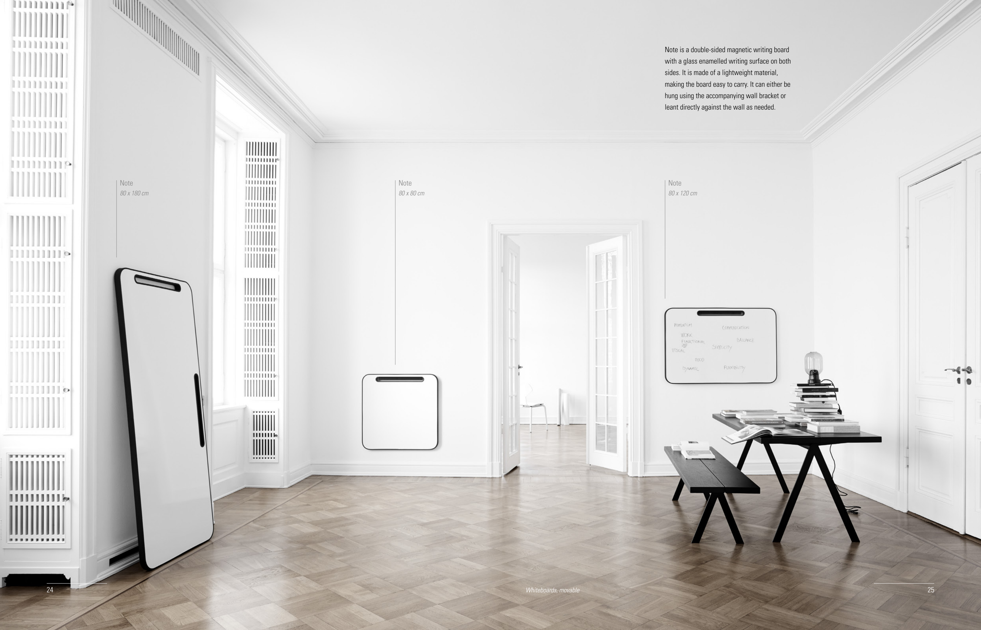
Note 80 x 180 cm