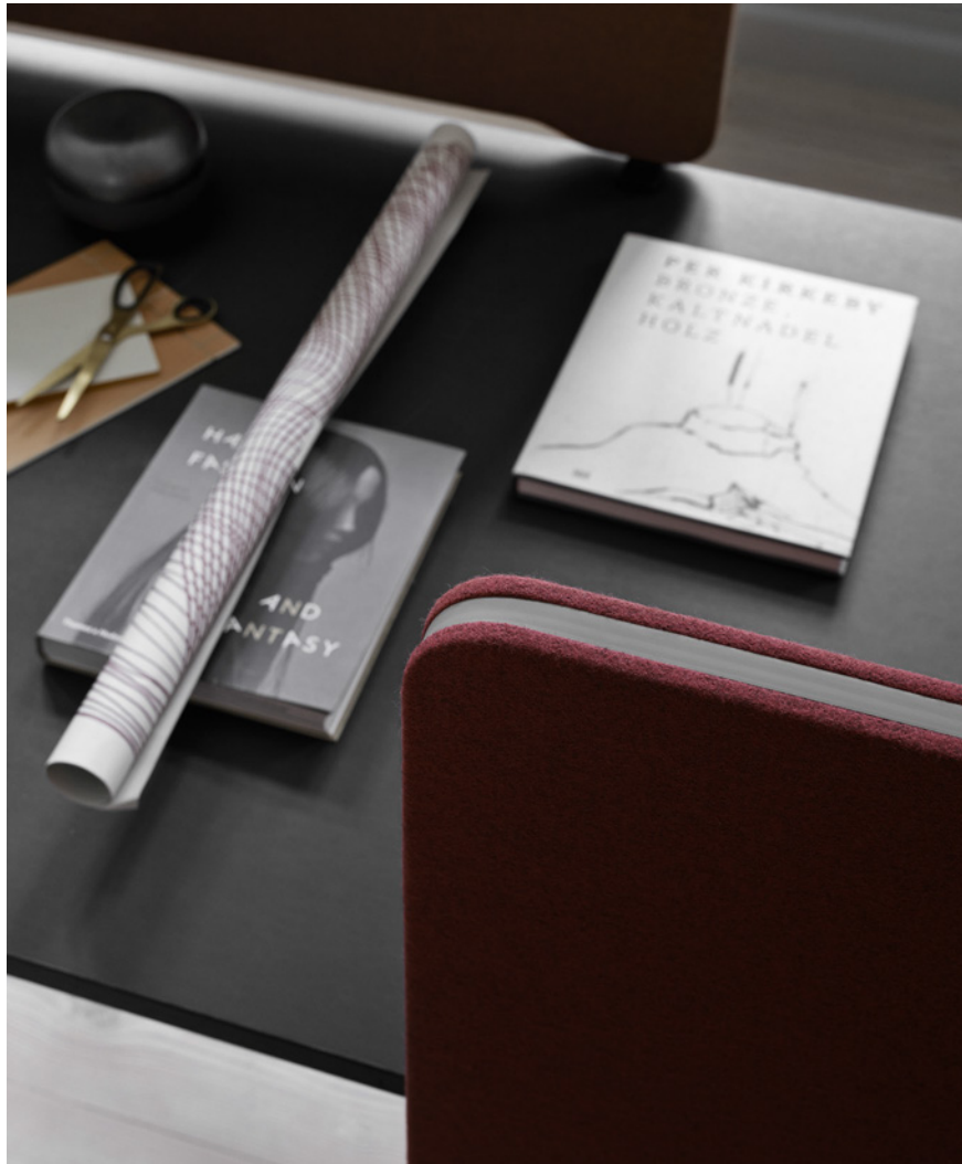
Edging strip Matt rubber edging strip Available in many colours

Like Edge Floor Screen, Edge Table Screen is also sound-absorbent. Comes ready for attachment to the table – front or top mounted.