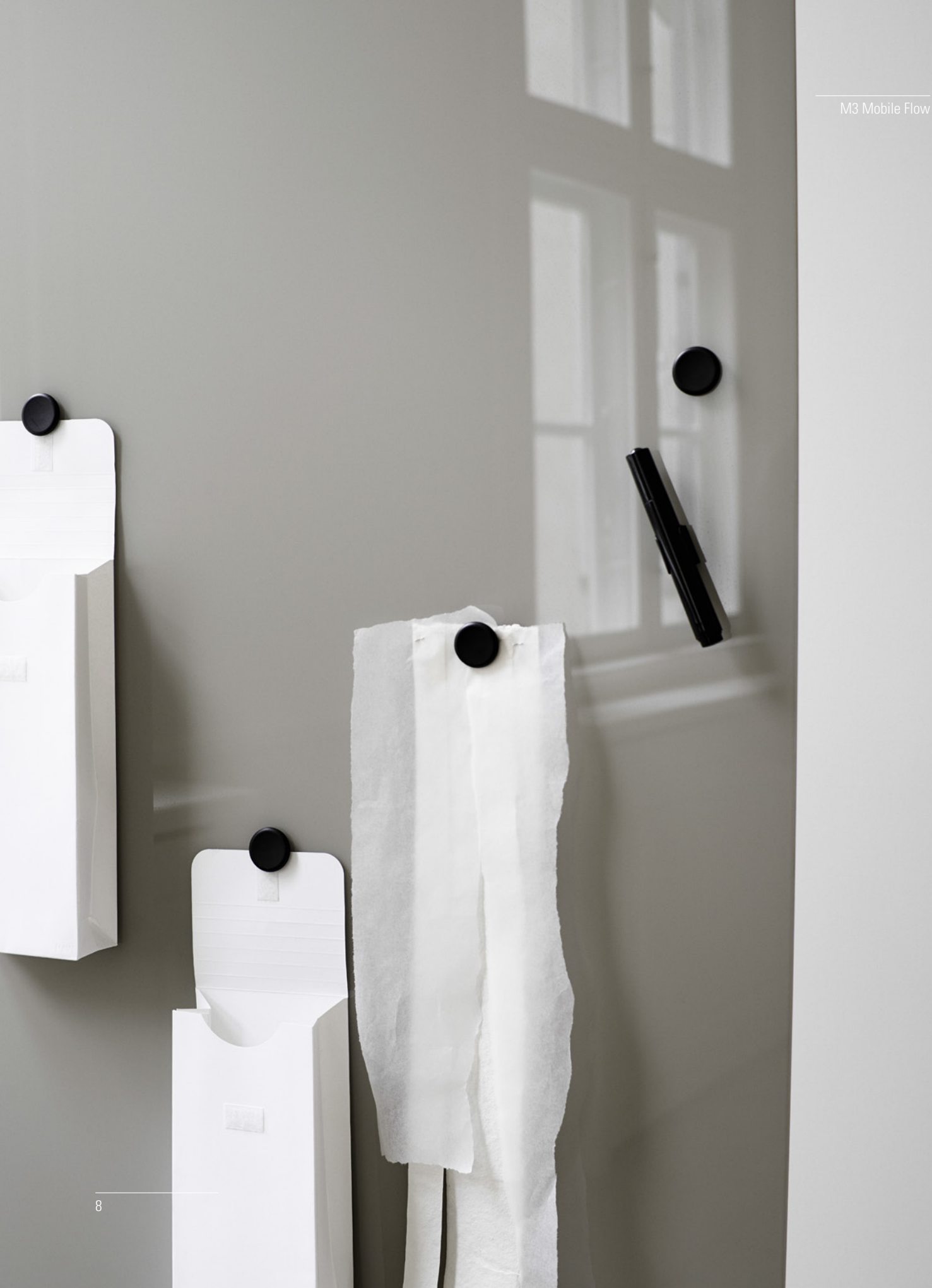
M3 Mobile Flow