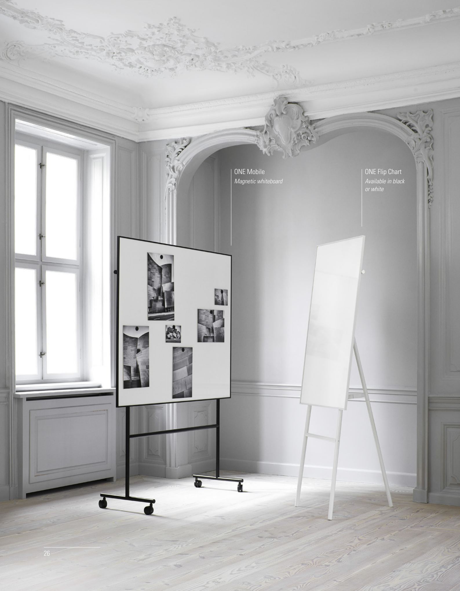
ONE Mobile Magnetic whiteboard